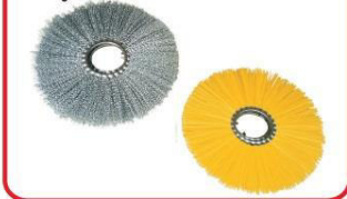
Poly and Wire Brush