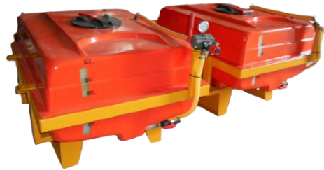
Attachment: Chemical Sprayer